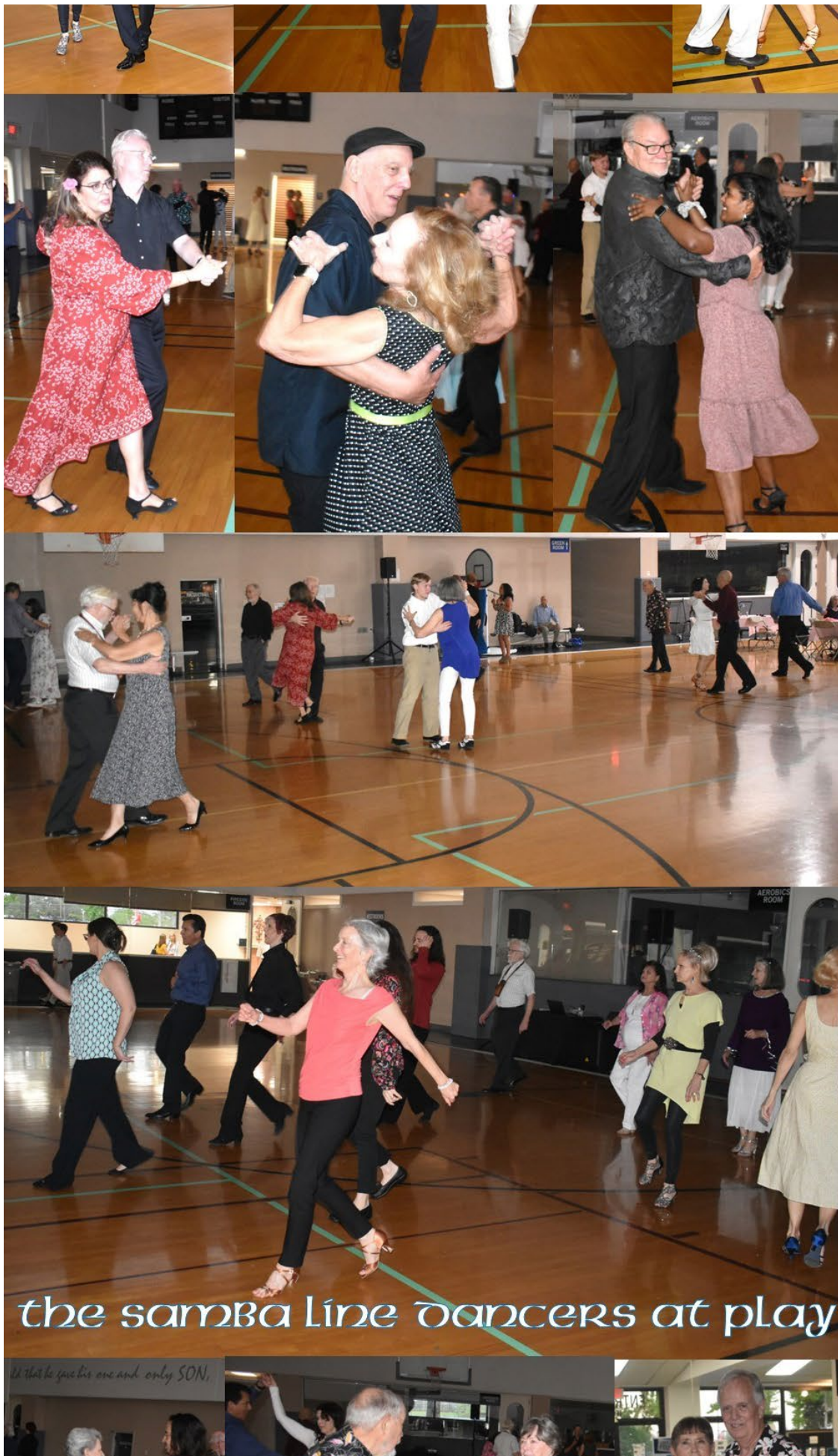
the samba line dancers at play