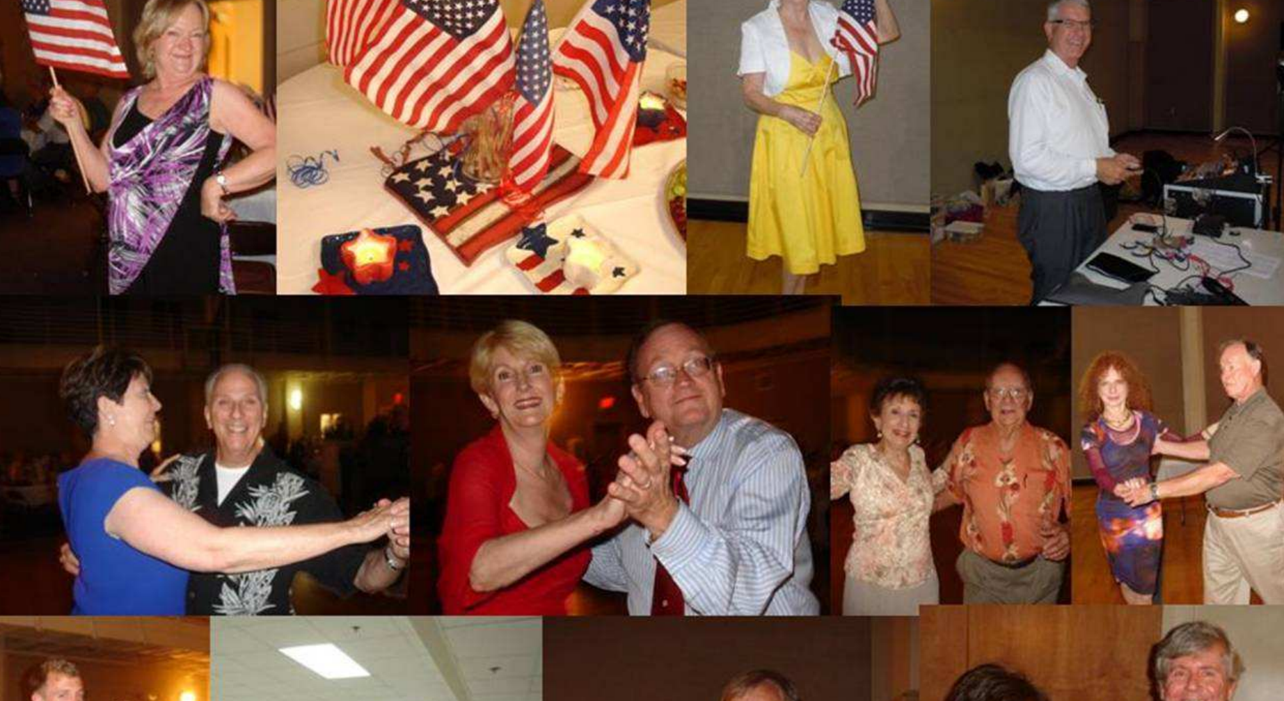
BEAUTY IN RED, WHITE, & BLUE